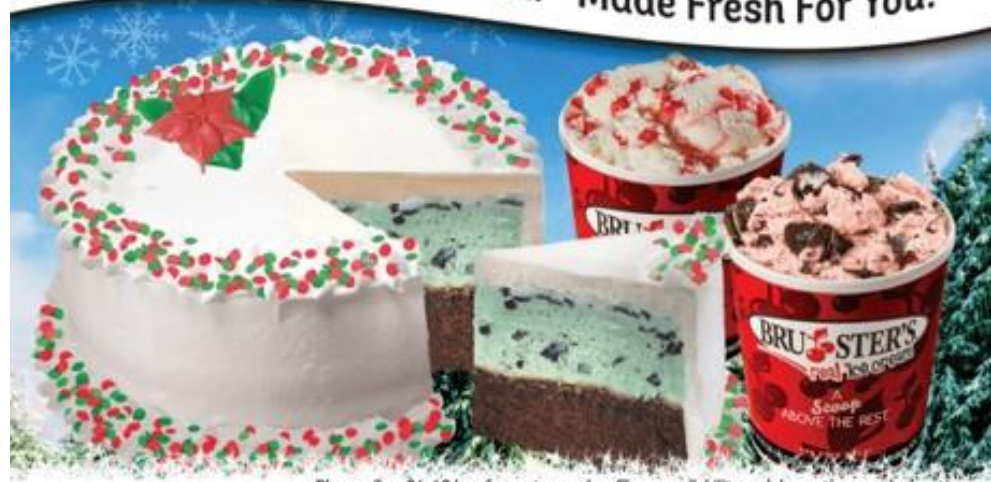
Please allow 24-48 hrs. for custom orders Flavor availability and decoration vary by location

Cakes, Pies & Hand Packed - Made Fresh For You!