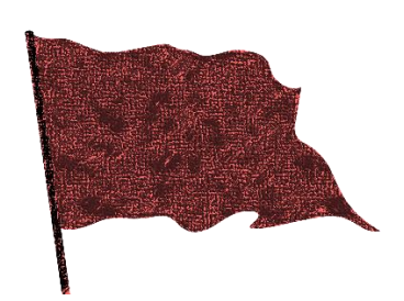
Spring Combined Musical: Les Misérables May 2-3, 9, 11 2024